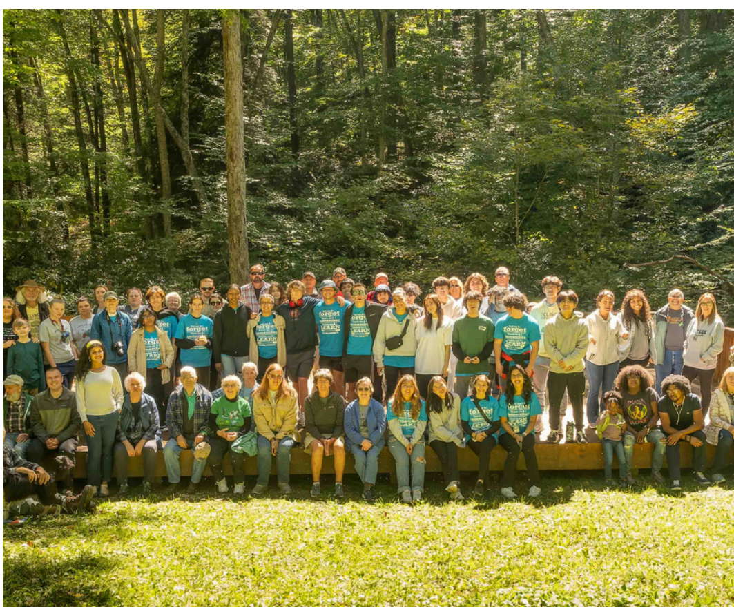
Group photo of attendees of the 2023 Naturalist Rally.