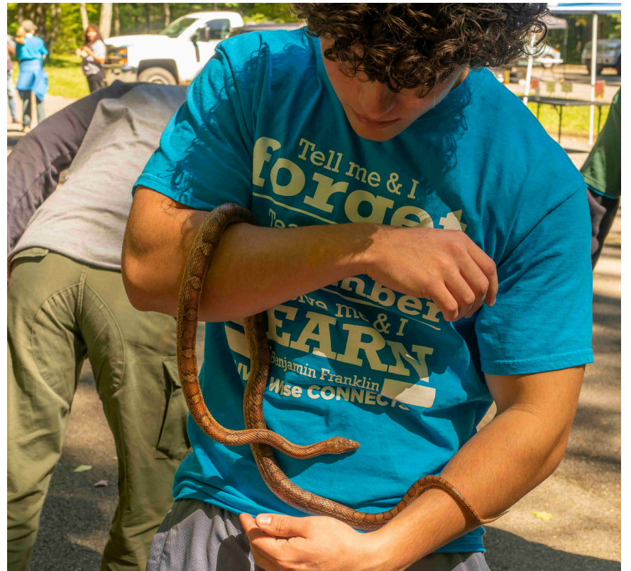
A UVA Wise Student enjoys the snakes provided by All Are Gods Creatures.

Thank you so much to the members of our community for making the event a success. Plans are already underway for next year, and TCC strives to make each year better than the last. See you at 2024's rally!