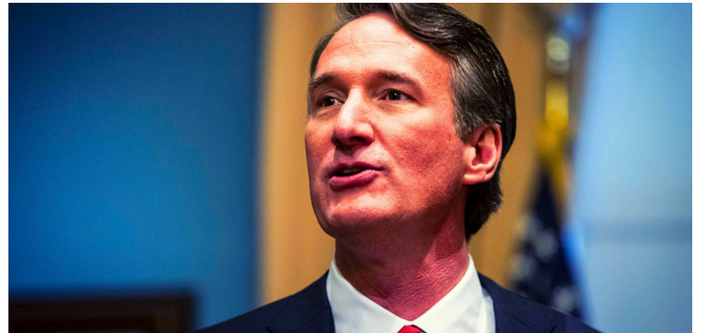
In October of 2022, Governor Youngkin clandestinely came to Norton, Virginia to announce his nuclear energy plan.

The Clinch Coalition Governing Board decided to navigate a new area of advocacy - raise public awareness and provide information on the dangers that nuclear energy and its radioactive waste can bring to SWVA. Since its founding in 1998, TCC has been a local, environmental non-profit focused primarily on confronting commercial logging in the Clinch Ranger District of the Jefferson National Forest, protecting streams and wetlands,