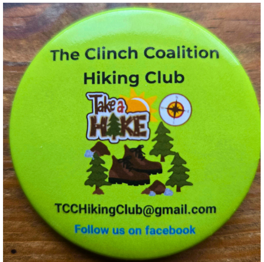
(Top) TCC Hiking Club badge created by Board member Gena Kiser

Earth Day 2024 featured The Clinch Coalition at the Farmer's Market in Abingdon from 9:00 am – to 1:00 pm on Saturday, April 20th.