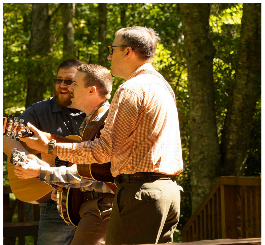
Live performance of the High Knob Ramblers at the High Knob Recreation Area Amphitheater.