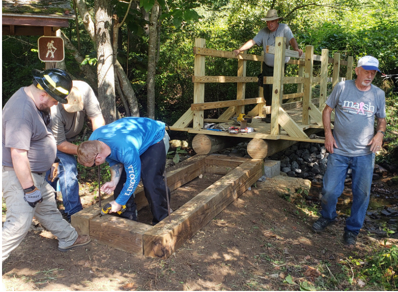
Volunteers for USFS working on bridge repair at Phillips Creek.