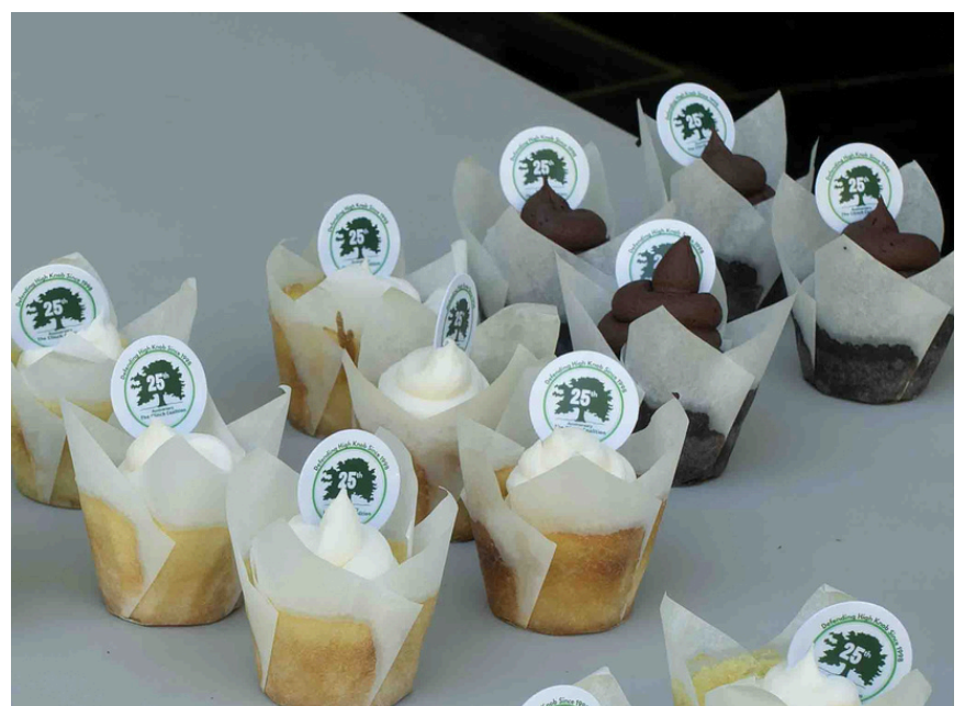
Cupcakes provided by Lincoln Road in celebration of TCC's 25th Anniversary.